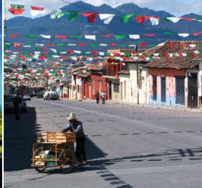
San Cristobal de las Casas