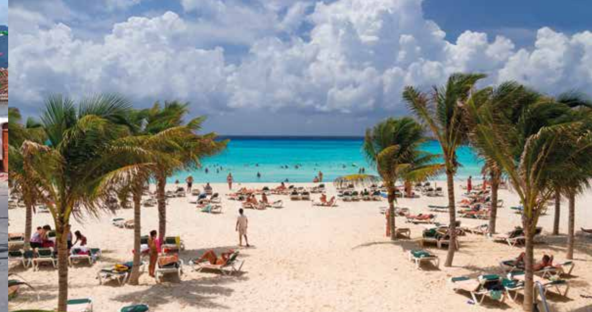
Playa del Carmen